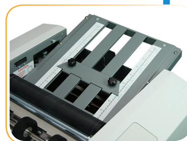
Redesigned fold plates - Clearly marked and easier to adjust