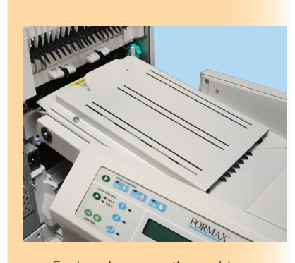
Enclosed paper path provides optimal document security