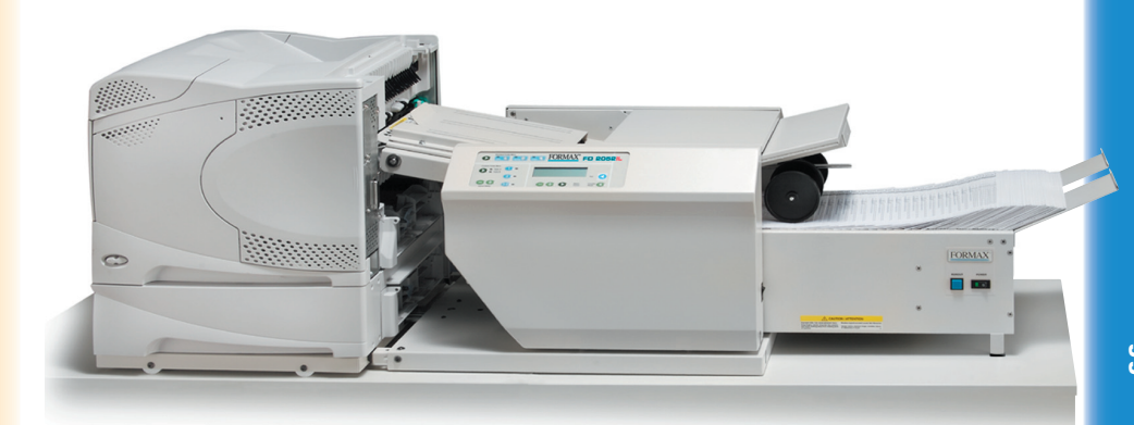
FD 2052IL System shown with IL Pressure Sealer and IL Alignment Base, laser printer (not included), optional conveyor and optional locking cabinets