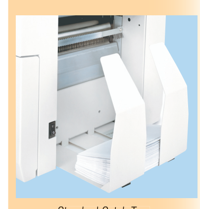
Standard Catch Tray

U.S. Patents: 5,772,841 5,865,925 5,968,308 6,264,592 Other Patents Pending