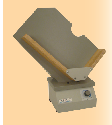
A 402 Series Jogger is a recommended option that reduces static electricity from forms and aligns them for proper feeding