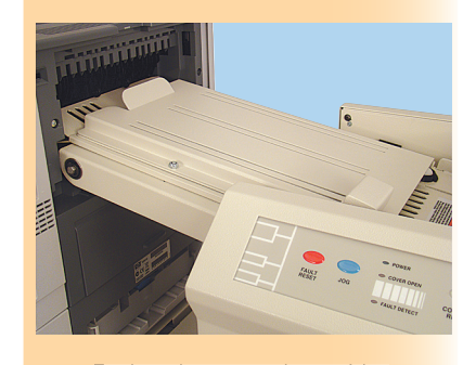
Enclosed paper path provides optimal document security