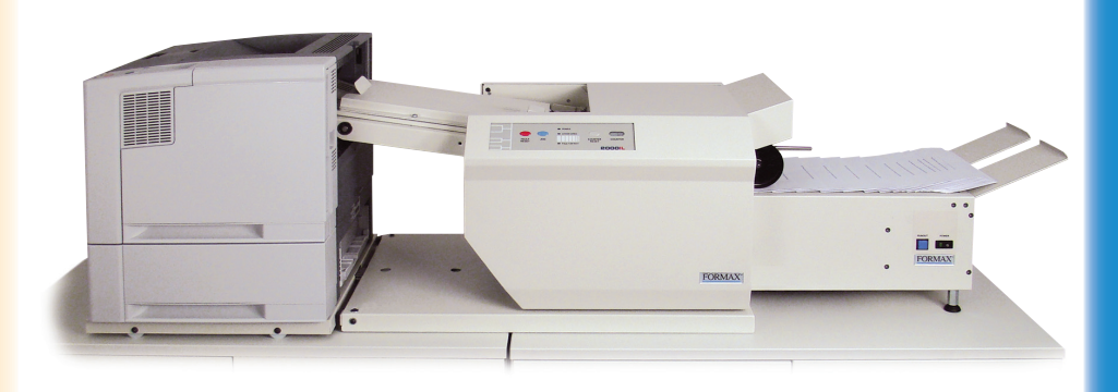
FD 2000IL System shown with IL Pressure Sealer and IL Alignment Base, laser printer (not included), optional conveyor and optional locking cabinets