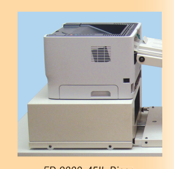
FD 2000-45IL Riser with HP/Troy P2015 Printer