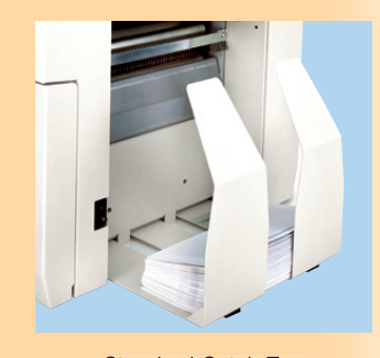
Standard Catch Tray