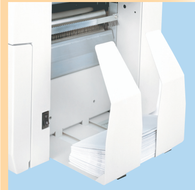
Standard Catch Tray

The FD 2030 is designed for user friendly operation. Simply set your folds according to the clearly marked settings on the fold plates, load your forms, press start and you're on your way. The FD 2030 has LED indicators for power on, fault detection, paper out and cover open. It also includes a six-digit counter for audit control.