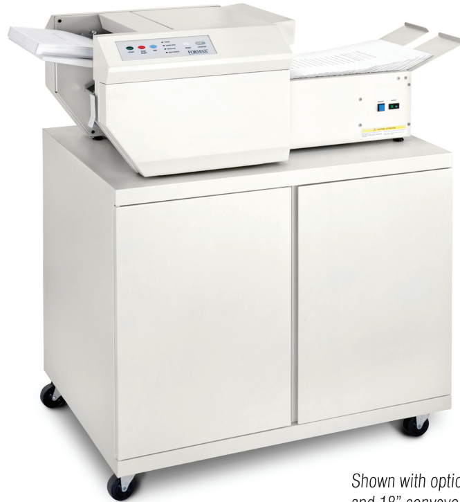
Shown with optional cabinet and 18" conveyor

The FD 2030 AutoSeal ® desktop pressure sealer provides a reliable and compact solution for processing pressure sensitive self-mailers. Standard features include a six-digit counter, jog control, fault detection, LED indicators and an operator friendly touch-pad control panel. Up to 250 forms can be loaded in the feeder and processed at speeds up to 9,000 forms per hour. All of these features make the FD 2030 the perfect solution for streamlining your post processing. The FD 2030 also has an optional fully enclosed cabinet for storage, and a choice of two conveyors with photo-eye for neat and sequential stacking of processed forms.